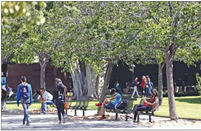
Cal State LA is ranked No. 1 in the U.S. for student upward mobility.